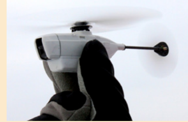
Prox Dynamics' camouflage-gray Black Hornet weighs just 16 grams, is 10 centimeters long and has a 4-inch rotor span. Designed for infantry units, the aircraft is equipped with a nano-camera capable of sending back high-definition motion video or still images to its operator via a tablet-size LCD screen.

Prox Dynamics' nano-sized Black Hornet, which has been developed in cooperation with the state-funded Norwegian Defense Research Establishment (NDRE), already has been sold to the British and Norwegian armies. CybAero also has been investing heavily to produce more sophisticated macro-sized UASs with more nano-technology content. The Swedish company formed a strategic helo-UAS partnership with U.S.-based AeroVironment in November 2012. Under the agreement, AeroVironment will use CybAero's current product APID 60 in the UAS systems it sells to the U.S. military.