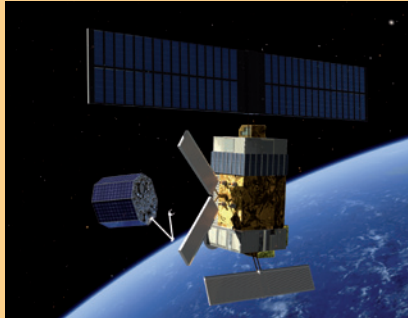
An artist's concept shows how a defunct satellite could be grappled for a controlled re-entry into Earth's atmosphere, where it would burn up and be destroyed harmlessly. This is one of several concepts for clearing dead satellites from orbit being studied by space agencies and industry experts.

The findings also suggested the removal of space debris is an environmental problem of global dimensions that must be assessed in an international context, including the United Nations. The results were presented to more than 350 worldwide participants, representing almost all the major national space agencies, industry, governments, academia and research institutes.