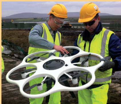
Lightweight multicopter UASs such as the Aibotix X6, shown here, are proving ideal for infrastructure inspections of powerlines, bridges, dams and power plants.

"For us this is really the next step in our UAS strategy," said Rüdiger Wagner, general manager of Leica's geospatial solutions division. "UAS-based mapping solutions are on the increase, and we have been carefully expanding our exposure to this market by focusing on select applications."